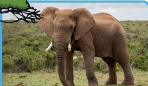
an African elephant