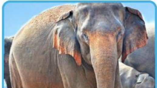
an Asian elephant